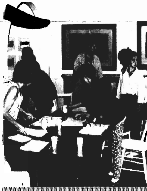
Only the table stands still: Moveable Feast '94

The 6th Annual Moveable Feast will be unveiled in beautiful Prince Edward Island under the gracious auspices of Theatre P.E.I, to whom we are extremely grateful for their generous support.