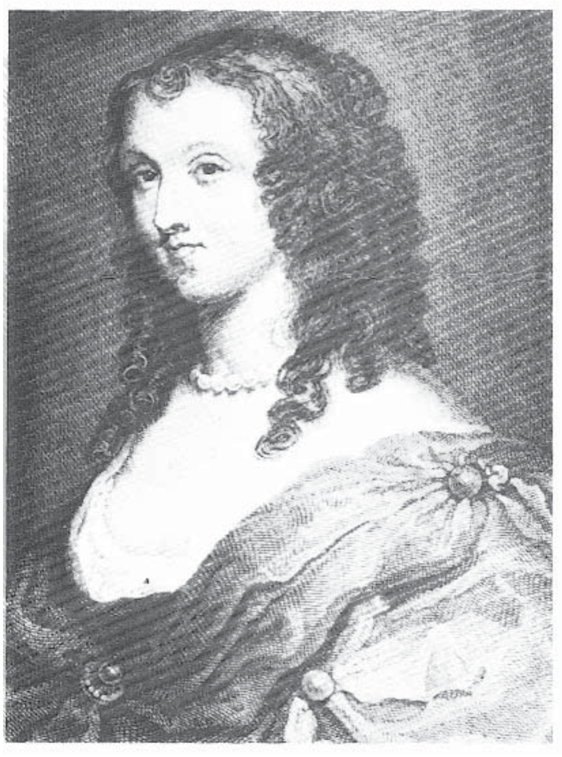
In Production At Brock University February, 2002