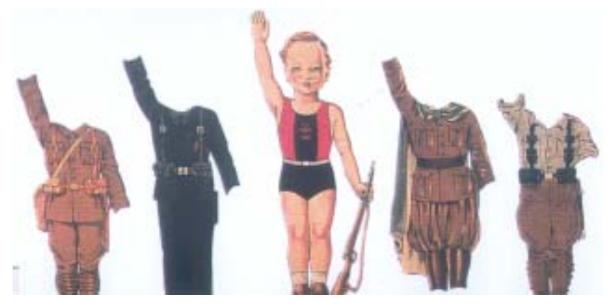
A paper cut-out doll with the Falangist Uniform of Franco's forces

him. By contrast, Wilmore is neither calculating nor corrupt. He is naieve. He assumes that everyone is motivated by the same indomitable, sensual Will as himself. His evil is more a blind spot than active malice. Perhaps when the audience see him bearing misfortune with the same openess, humour and verbal dexterity as he bears good fortune, they will understand him for what he is: a child of the moment. Wilmore lives completely in the present tense. This frees him from the dominant motivations of greed and politics which Behn loathes in social relations. Wilmore tells Don Pedro, "A Woman's Honour is not worth guarding when she has a Mind to part with it". By accepting Helena at face value without her fortune and despite her warnings of intended inconstancy, Wilmore roves outside the conventional Restoration fears of cuckoldry and material poverty. It is this spontaneity and honesty of spirit that Aphra Behn loved in him and which the audience must grasp at the same time that they see his shameful, dangerous sexism is unacceptable.